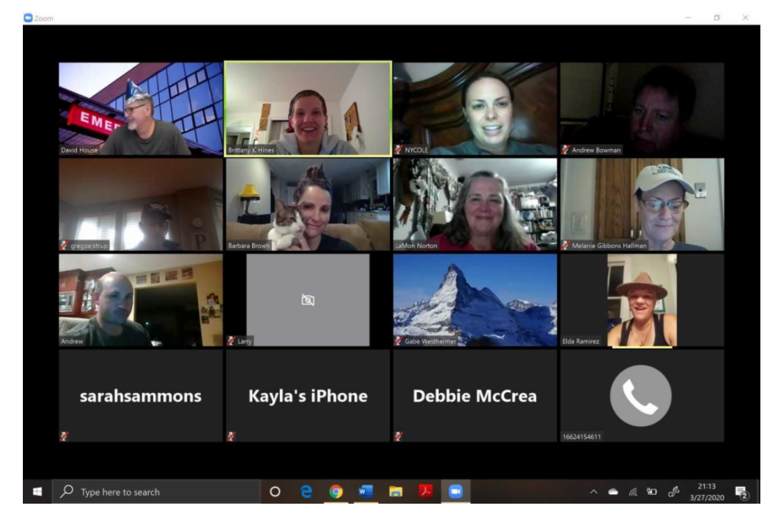
COVID Personal Protective Equipment Attire of Members