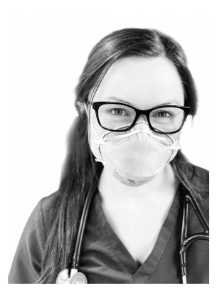
These photos are from UAB Medical West Emergency Dept in Bessemer, Alabama